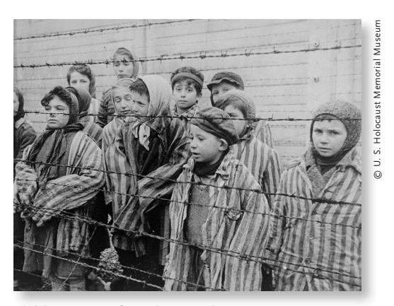
Child survivors of Auschwitz-Birkenau