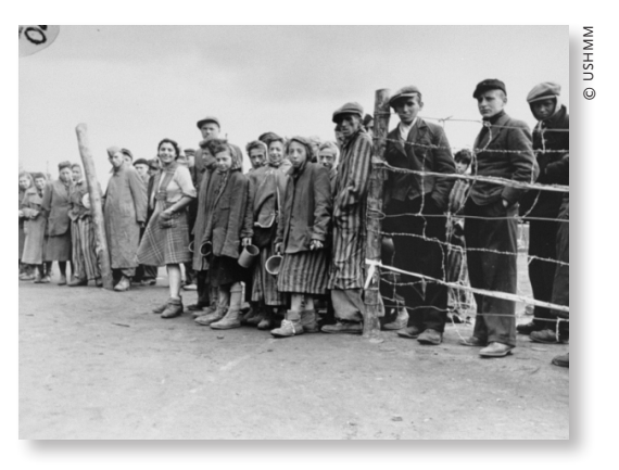
Bergen-Belsen concentration camp after the liberation.

During the spring of 1945 Soviet troops took the Baltic States, Northern Poland and Eastern Germany. They liberated camp after camp in these areas, among them Stutthof, Sachsenhausen and Ravensbrück. At the same time Allied troops advanced from the West. In the middle of April American forces reached the concentration camp of Buchenwald and British forces went into Bergen Belsen, where they found thousands of corpses and 60 000 severely ill and starving prisoners. 10 000 of them died from typhus and malnutrition during the first weeks after the liberation. The sight of thousands of unburied corpses and extremely emaciated prisoners met the soldiers in every camp. Very quickly radio reports and newspaper articles spread all over the world, and only now did many understand the magnitude of the Nazi extermination policy.